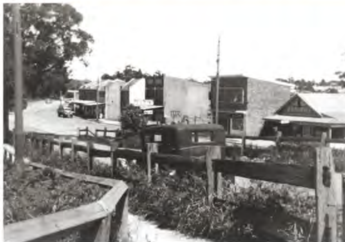
View of Asquith shops on Pacific Highway, looking from railway bridge 1940s.

A very successful and long term Asquith business was Halls Bakery which was located on the Pacific Highway just north of where KFC is today. Halls baked and delivered their bread far and wide, firstly by horse and cart, and then via a fleet of impressive motor vehicles.