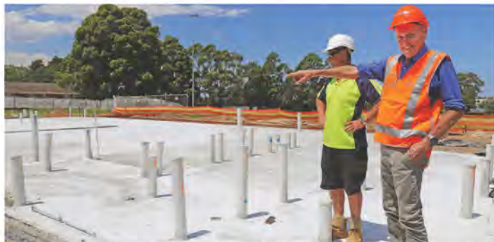
Contractors laying the concrete slab