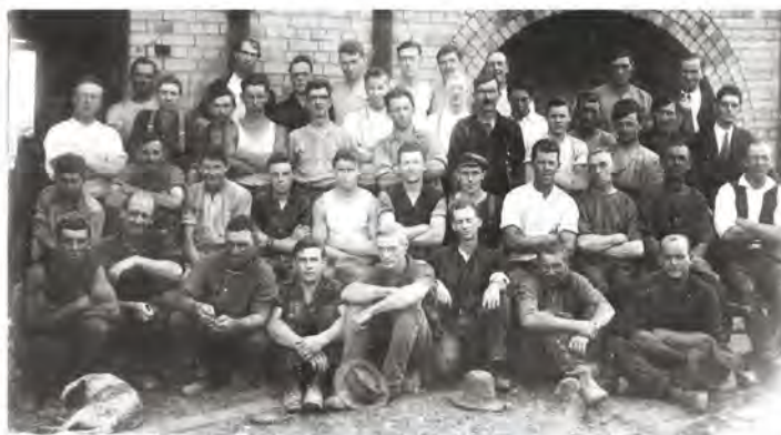
Fowlers Pottery workers 1930s

Fowlers Pottery opened in Asquith around 1900, producing bricks and agriculture pipes until the effects of the Depression forced its closure in 1929. The site remained dormant until November 1948 when a refugee camp was established there with army tents for about 2 years. It was made up of 75 European men displaced by the events of World War II. In 1950 Hornsby Council purchased the site and Asquith Bowling Club was immediately established. Storey Park sports field was constructed and ready for use by 1953, named after long term Hornsby Councillor and State MP, Sid Storey, who was very actively supportive of these