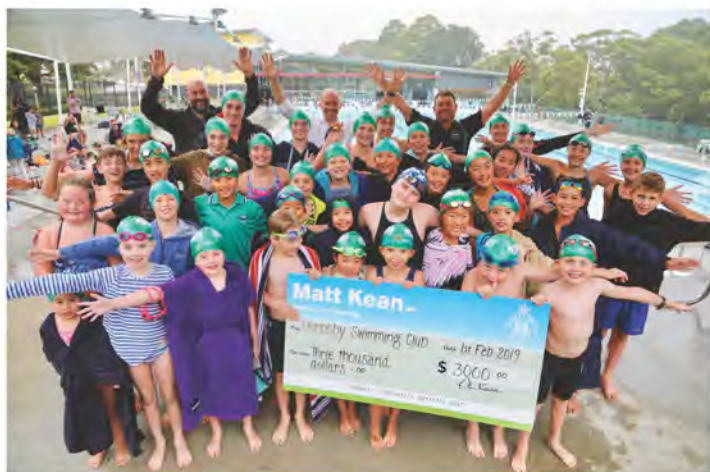
Hornsby Swim Club