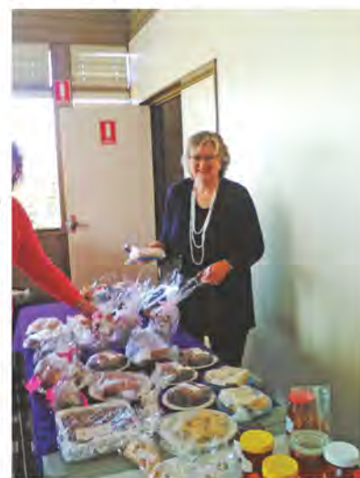
One of the ways funds are raised through a monthly trading table which sells delicious home-made produce, books and other goods.

VIEW stands for: Voice, Interests and Education of Women.