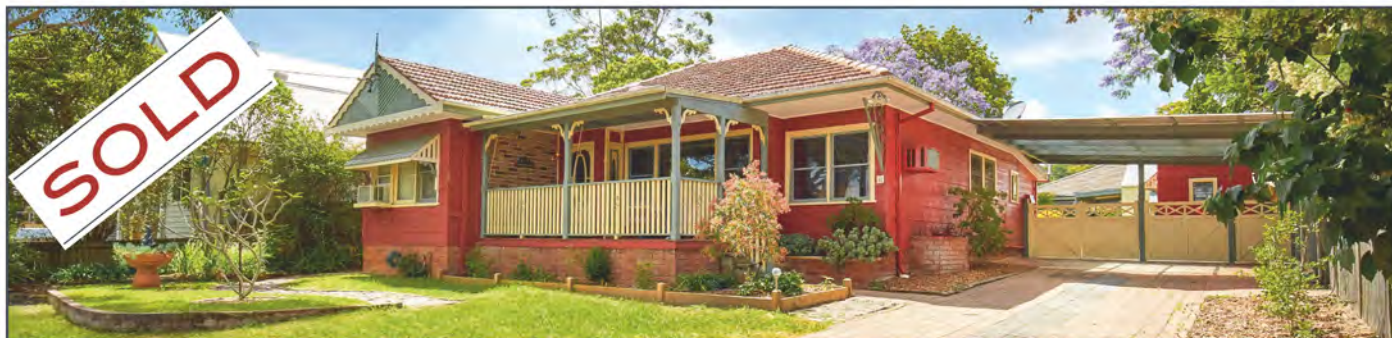
11 Crowley Rd, BEROWRA - SOLD AFTER ONE OPEN HOME