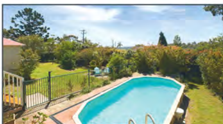
82 Turner Rd, BEROWRA HTS Guide: $950,000