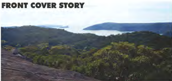
Lion Island and Broken Bay as seen from Taffy's Rock.