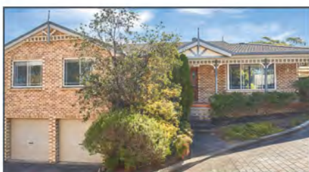
119A BWR, BEROWRA HTS $1,075,000