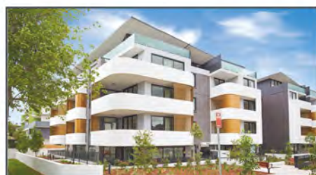
5/1 Citrus Ave, HORNSBY $695,000