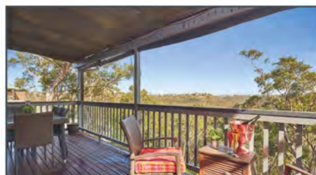
12 Easton Rd, BEROWRA HTS $979,000