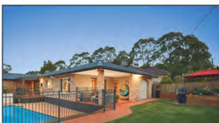
2 Eden Dr, ASQUITH $1,445,000 - $1,495,000