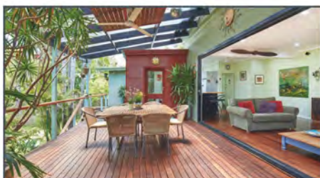
12 Sydney Rd, HORNSBY HTS UNDER CONTRACT